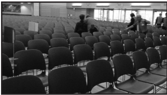
Getting the PSU Ballroom ready for the onslaught