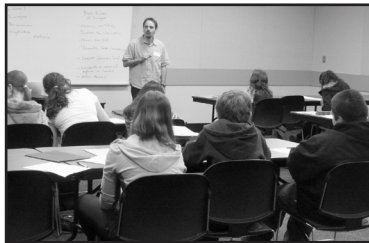
A Sharing Group at work