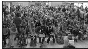
PSU Ballroom, OWF crowd