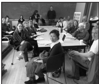
OWF Adult Workshop