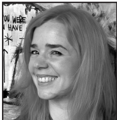
Laini Taylor, keynote for high schoolers